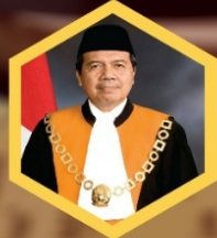
Dr. H. Muhammad Syarifudin, S.H., M.H. Chief Justice of Supreme Court of Indonesia