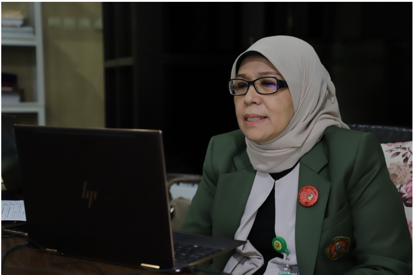
Chancellor of the Jakarta Veterans National Development University (UPNVJ) giving a speech